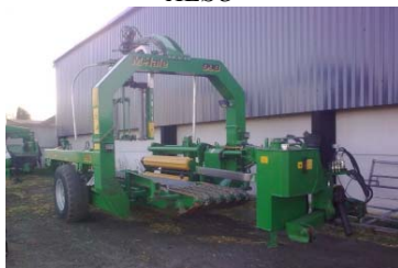
2005 McHale 998 Wrapper with round bale kit (Only Wrapped 40k bales)

Enquiries to Alastair Brown on 07831 395 167