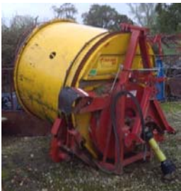
TEAGLE Tomohawk 400 Round Bale Chopper (For Sale due to the change to Sawdust Bedding) ALSO