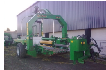
2005 McHale 998 Wrapper with round bale kit (Only Wrapped 40k bales)

Enquiries to Alastair Brown on 07831 395 167