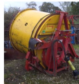
TEAGLE Tomohawk 400 Round Bale Chopper (For Sale due to the change to Sawdust Bedding) ALSO